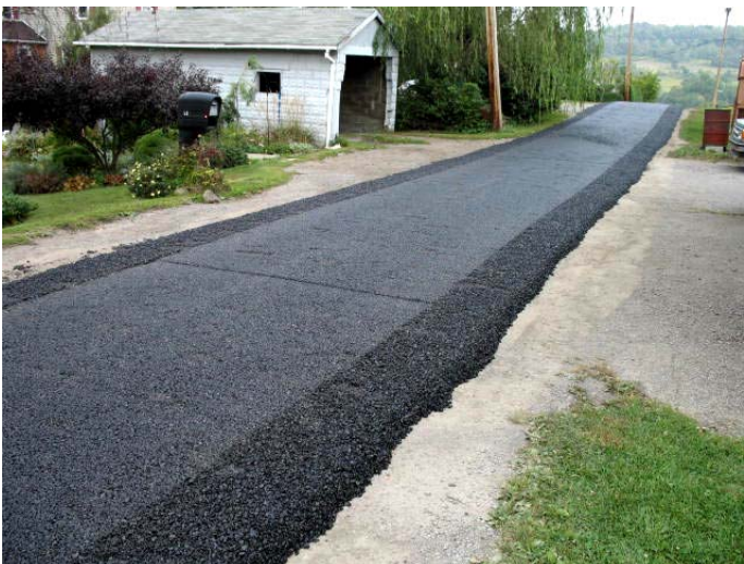
Paved, awaiting roller