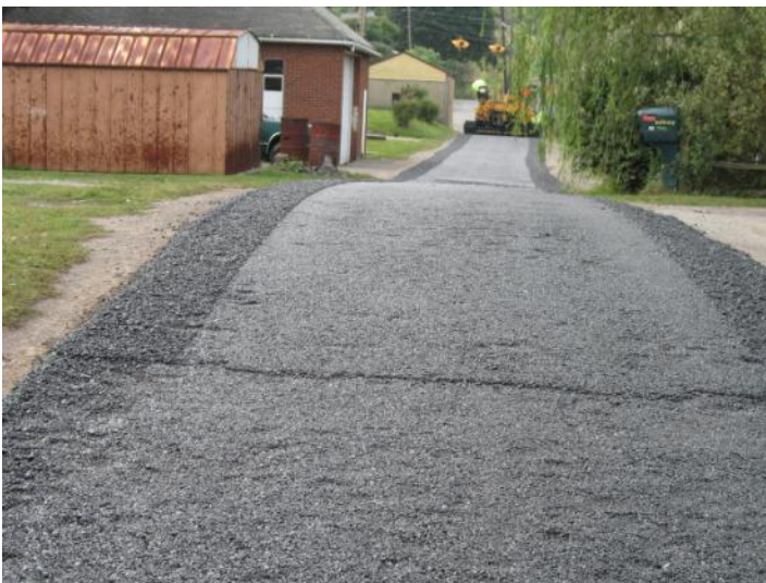
Paved, awaiting roller