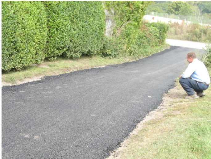
----- Finished job – lower section -----